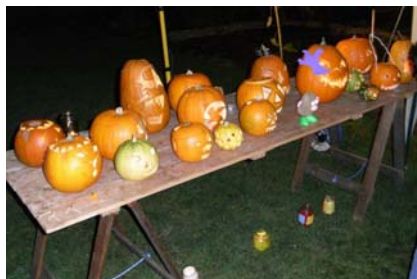
Jack o' Lanterns light up the evening