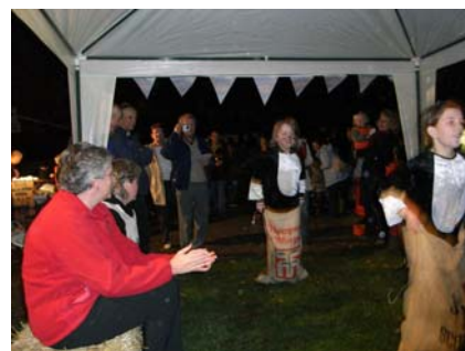
Sack races between the straw bales