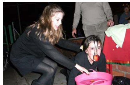
Spartan apple meets its match